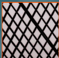
External structural skin white