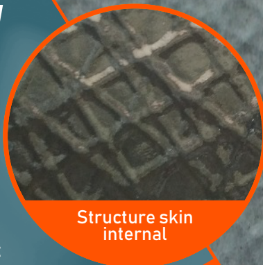
Structure skin internal

All our products are totally customisable by choosing among any fiber, skin and grid. Shown data represent recommendations provided according to our experience and fibers technical features.