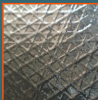
Double internal structural skin