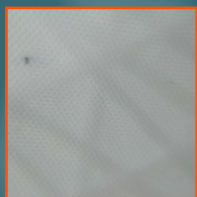
Double external taffeta white