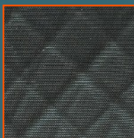
Double external taffeta black