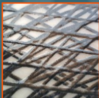
Internal taffeta white black aramid

Type ARAMID Skins: Double external taffeta