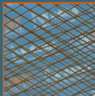
Film on film yellow aramid