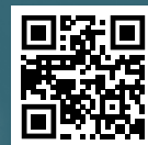
Visit the products page on our website