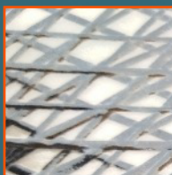
Internal taffeta white