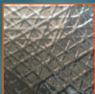
Internal Structural Skin black