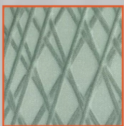
Polyester External Taffeta Grey